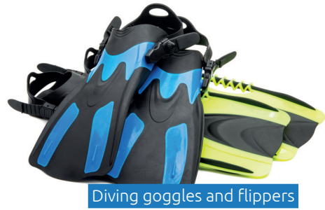
Diving goggles and Flippers