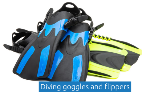
Diving goggles and Flippers